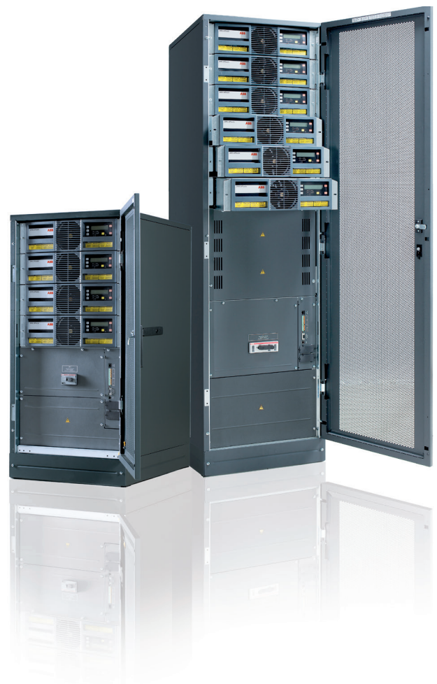
DPA UPScale ST 80