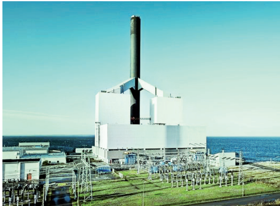
Kyndby Power Station in Hornsherred is the emergency and peak load facility for Zealand.

Kyndby Power Station in Hornsherred is the emergency and peak load facility for Zealand. Operated by DONG Energy, one of the leading energy groups in Northern Europe, the 734 megawatt (MW) capacity Kyndby station's facilities can be started up within minutes if operational irregularities occur in the high-voltage electricity grid, or problems arise at other power stations.