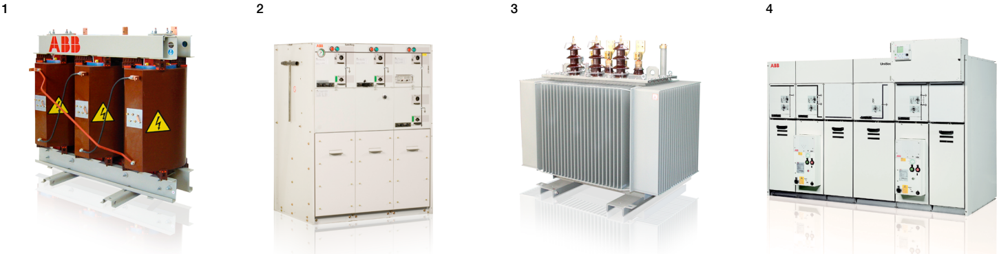
1 Dry type transformer | 2 SafeRing/SafePlus | 3 Oil type transformer | 4 UniSec

MV switchgear can be chosen from several ABB technologies: air insulated switchgear (UniSec) and SF6 insulated (SafeRing). Voltage levels can go up to 40,5 kV with very compact footprints. Switching and interrupting can be done with vacuum technology assuring high reliability. Switchgear can be equipped with relays for simplified transformer protection or with feeder terminals for more complex automation. Sensors, measuring, or remote control can also be added. Units are designed with an automation migration path, for future improvement as required.