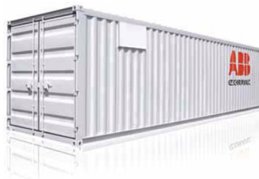
Secondary Enclosed Unit