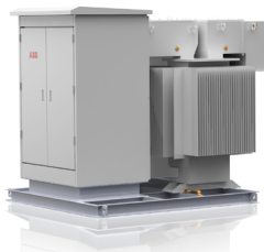
Secondary Skid Unit