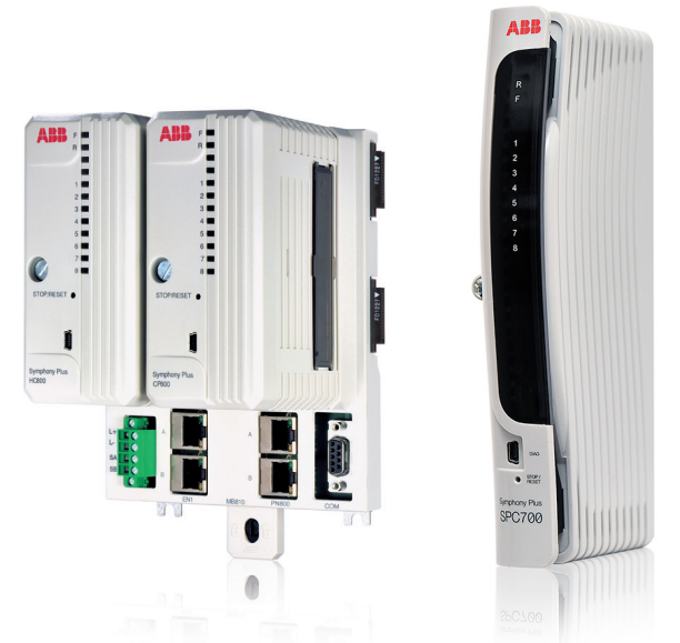
Symphony Plus SD Series. Delivering flexible automation for a sustainable world.

Introducing the newest addition to the Symphony Plus family: the SD Series – a green portfolio of completely scalable control and I/O products that work across the entire control landscape and delivers total plant automation regardless of application type, size, or physical location. Energy efficient, scalable architecture, compact lead-free design, extreme operating range, optimized footprint, field proven technology, and device and electrical integration make SD Series the best solution for your new installation, upgrade or expansion.