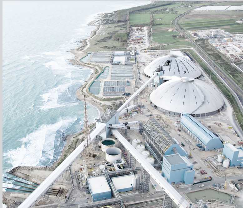
Symphony Plus Total Plant Automation. The power of a well-orchestrated performance.