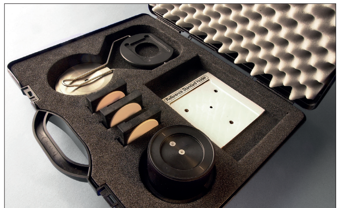
Accessories, such as working standards, fixtures and measurement apertures.

Whiteness is a measure of the white appearance of a paper sample. By calculation the observer's visual perception of this whiteness is simulated. The whiteness is measured at D65/10° or C/2° illuminant/observer. The whiteness is calculated according to the CIE or Ganz-Griesser method.