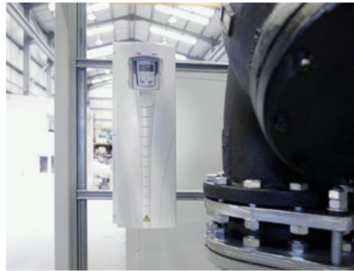
The drives ease of mounting and integration into building automation systems makes them highly advantageous.

In HVAC applications, using a variable speed drives on pumps and fans help reduce energy consumption significantly (compared to throttle/damper control with direct-on-line motors). With pumps and fans, a 20 percent reduction in motor speed can reduce the power required by up to 50 percent.