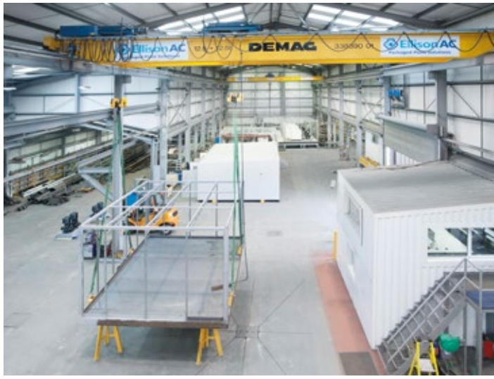
High quality, space and energy efficient products are designed for the end user.