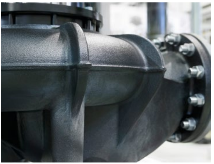
Ellison AC installs ACH550 drives on pump applications ranging from 3 kW up to 110 kW.