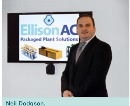
Ellison AC Projects Director

Ellison AC has designed and purpose-built their manufacturing facility in Morecombe, Lancashire, UK to streamline the production of the packaged plants.