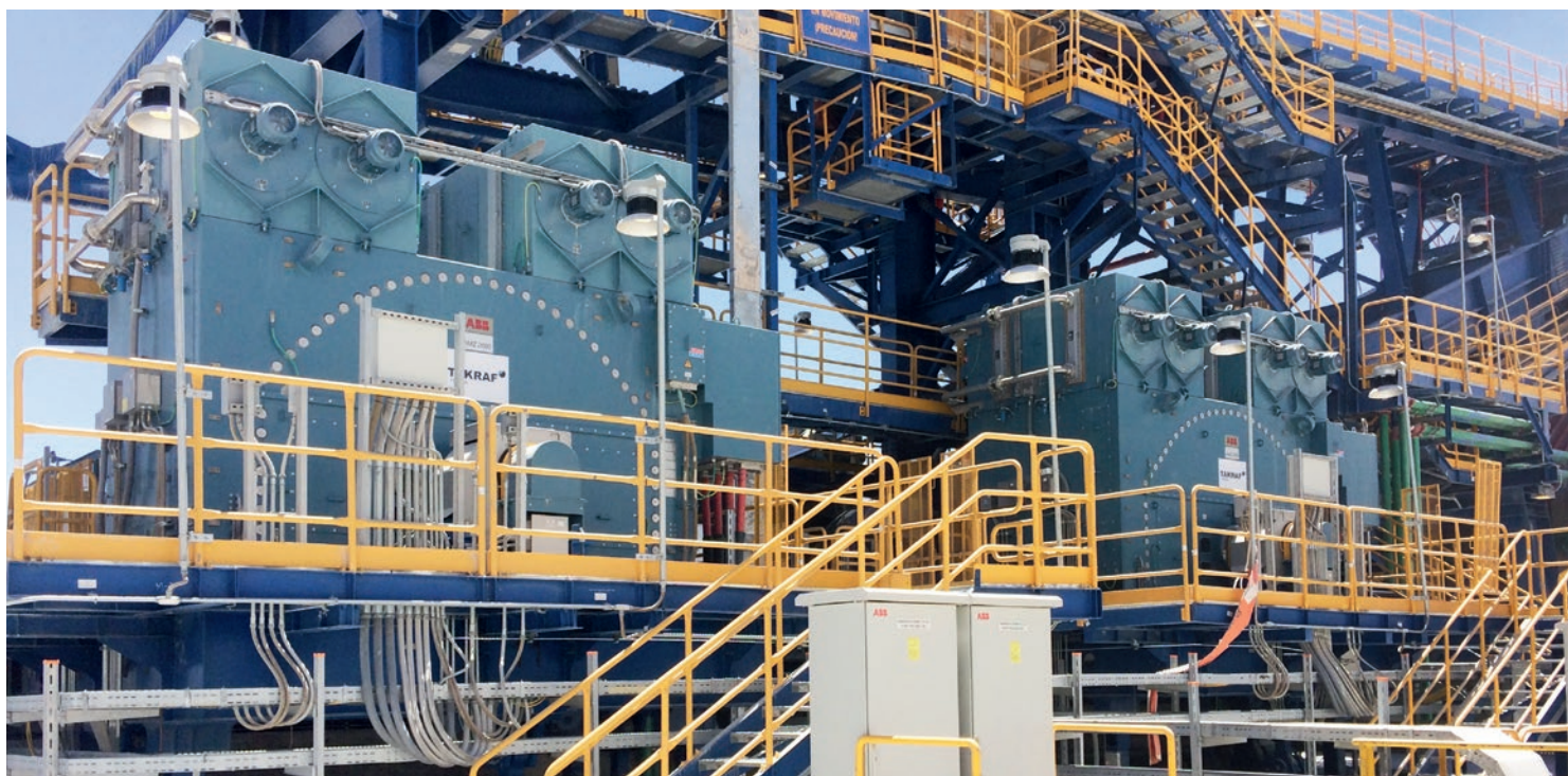
Gearless conveyor drives (GCD) for high power

Over a 15 year period, this mine would save about $12 million by using gearless conveyor drives.