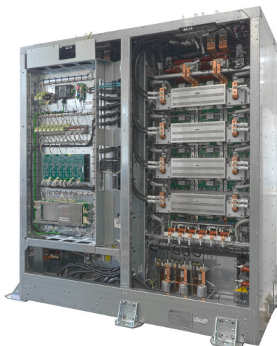
— BORDLINE® CC1500 AC for electric multiple unit