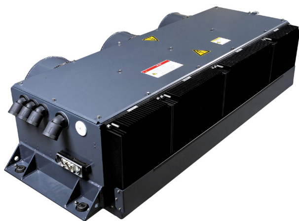
— BORDLINE® M45 AC for passenger coaches

For passenger coaches with 1000 Vac train line voltage