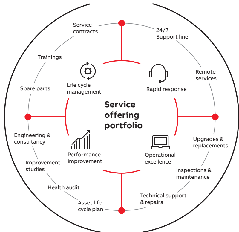
ABB covers the entire high power rectifier service portfolio of all product types. Our experts will support you throughout the whole life cycle of your equipment in order to evaluate the best possible solution.