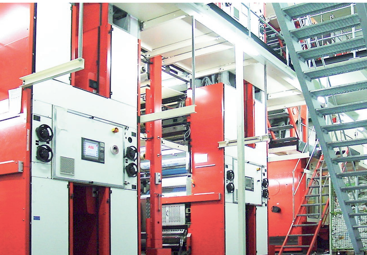
Wifag OF7 press converted to shaftless and restacked at Südostschweiz Medien in Haag, Switzerland

The large number of references include La Vanguardia in Spain and L'Alsace in France.