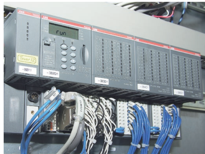
Advant Controller AC500

Spare parts are available from local ABB organizations and third-party suppliers all over the world.