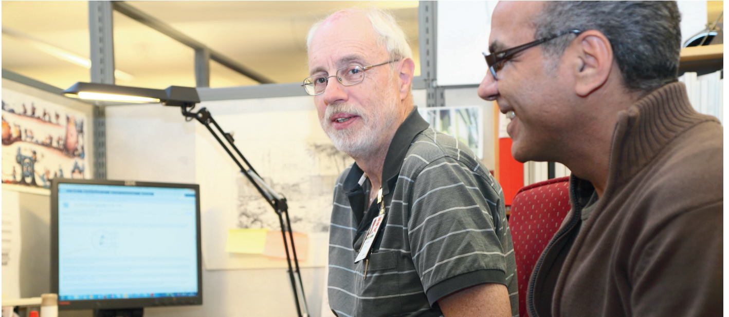
ABB Force Measurement service center in Västerås, Sweden has the capability to do tests, inspections and repairs for all customers independent of location but with focus on European, African, Indian and Middle East customers. The service center offers a broad range of repair services of all Force Measurement products and is equipped with the latest technology to ensure high quality inspections, tests and repairs.

ABB Force Measurement service center strictly follows established repair and faultfinding procedures, starting with visual inspection, cleaning, detailed inspection and diagnostic measurements. Continuing with the actual repair work and ending with functional tests.