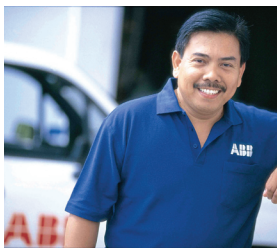
ABB Product Index A - Z