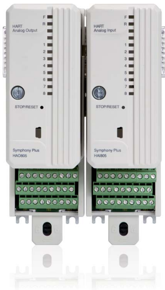
1 SD Series HART I/O: HAI805 and HAO805

No other automation platform has such a long field record and large installed base in power and water applications as Symphony. For more than 30 years, ABB has evolved the Symphony family, ensuring that each new generation enhances its predecessors and is backwardly compatible with them - all in accordance with ABB's long-held policy of 'Evolution without obsolescence.'