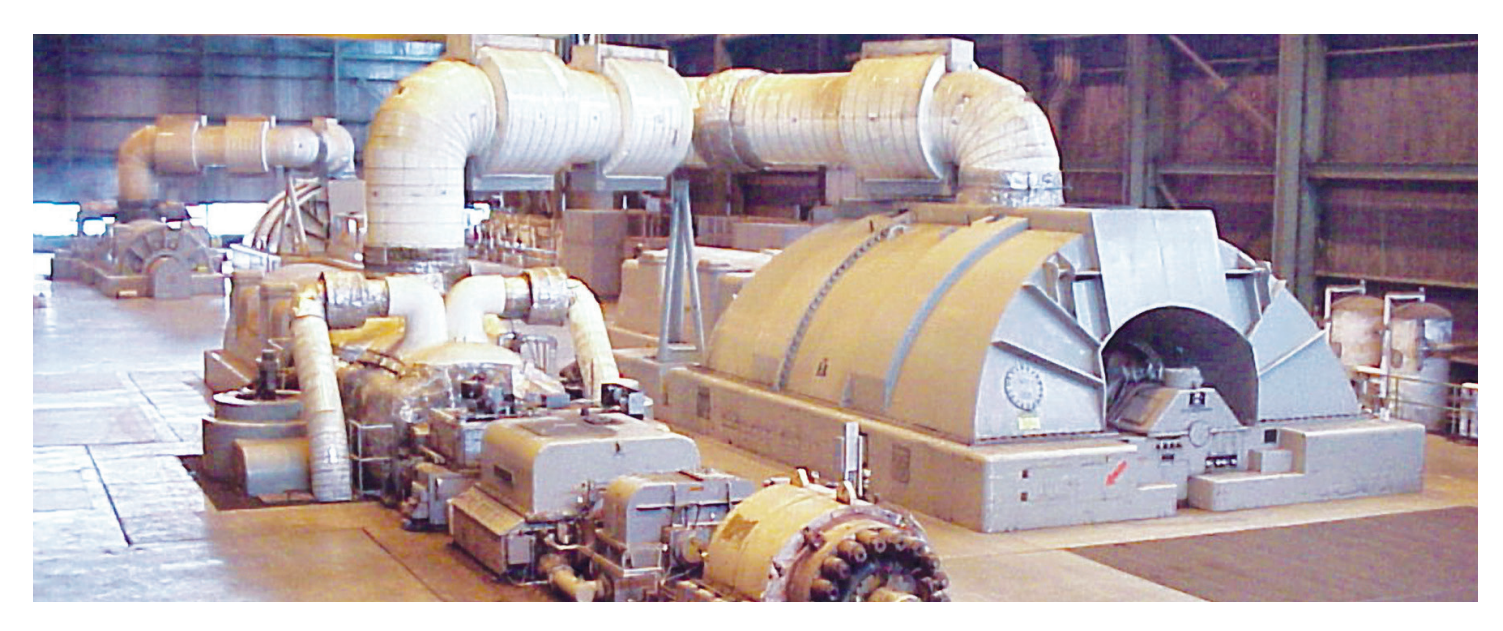
ABB offers comprehensive maintenance offerings and protection solutions for your steam turbine electro-hydraulic control (EHC) system

ABB's hydraulic repair and reconditioning service specializes in bringing equipment back to its original performance, helping to prevent costly failures and improving plant safety.