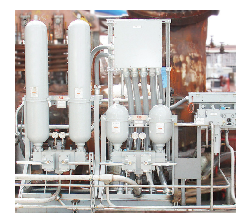
ABB offers comprehensive maintenance offerings and protection solutions for your steam turbine electro-hydraulic control system.

ABB has partnered with industry recognized contractors and has working relationships with most major AE firms to provide a full complement of start-up and installation services. These services include on-site supervision and technical support of customer or third party manpower resources, complete turnkey responsibility for installation and commissioning and many other related on-site services including system audits, vibration analysis, training, and maintenance services.