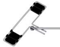
KHB 5 Holder for 3 to 5 cable channels.