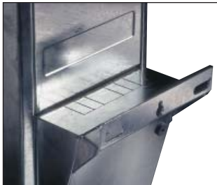
Breakouts for cable channels on the back of the pole-mounted cabinet.