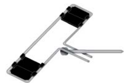
KHB 7 Holder for 5 to 7 cable channels.