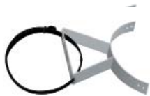
KKS Extra support for cable channel.