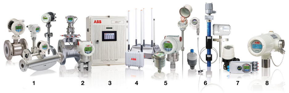
1 Oil, Gas, and Water Flow | 2 Multivariable | 3 Flow Computers / RTU | 4 Wireless 5 Pressure and Temperature | 6 Level | 7 Valve Control | 8 Analyzers

Whatever your application, ABB provides a wide range of instrumentation, analyzers and automation solutions for the upstream oil and gas chain to help you manage your operations safely, productively and profitably.