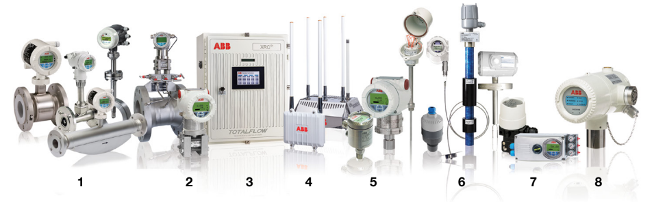
1 Oil, Gas, and Water Flow | 2 Multivariable | 3 Flow Computers / RTU | 4 Wireless 5 Pressure and Temperature | 6 Level | 7 Valve Control | 8 Analyzers

Whatever your application, ABB provides a wide range of instrumentation, analyzers and automation solutions for the upstream oil and gas chain to help you manage your operations safely, productively and profitably.