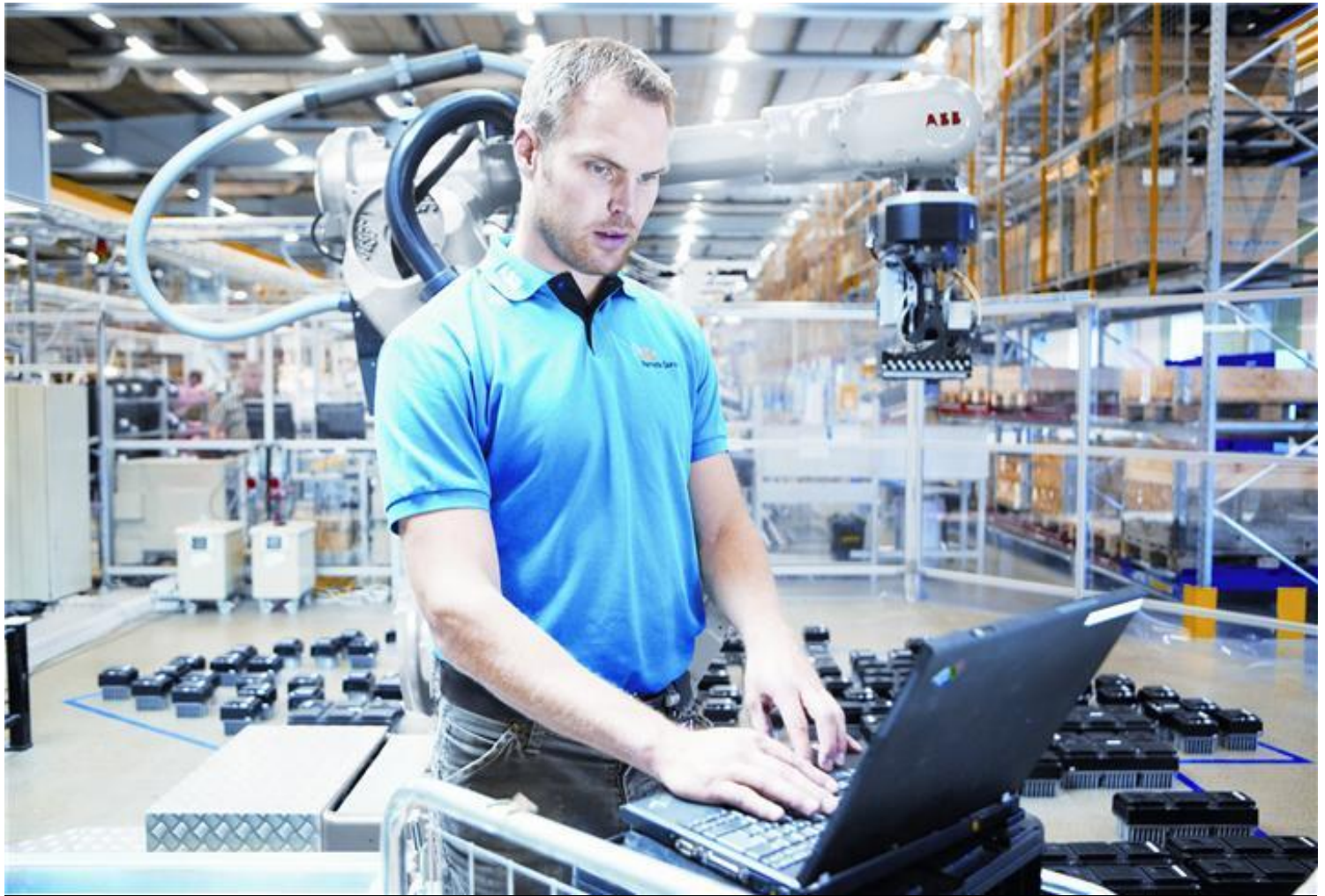
ABB Czech Republic, Robotics