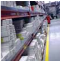
An integrated approach to project management