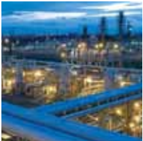
Integrity Studies BP

ABB Engineering Services works with the major international oil and gas companies, providing leading edge technical solutions.