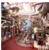
Plant Expansion Rhodia

A strong regulatory environment combined with ever-growing commercial and operating pressures makes the chemicals industry one of the most challenging.