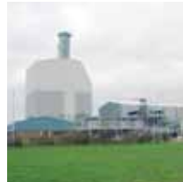
Legislative Compliance Centrica

“The services of ABB Engineering Services in the year leading up to our refinery overhaul was a key ingredient in the success that followed. Such services employed within this period included Risk Based Inspection and also multi-functional design to significant capital projects.”