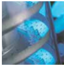
Packaging equipment downtime reduction