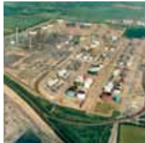
Environmental Consultancy Total