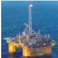
Shutdown Improvement Marathon Oil