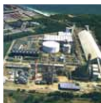
Asset Life Study Petroneas

“During a recent period of high demand, the gross margin has been improved by more than US$ 9 million over eighteen months operation. Savings on capital investment and associated depreciation exceeded US$ 3 million.”