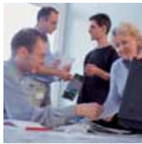
Representing the client in an integrated team