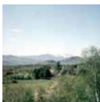
Environmental Consultancy Monckton