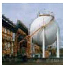
RBI and Integrity support Hydropolymers