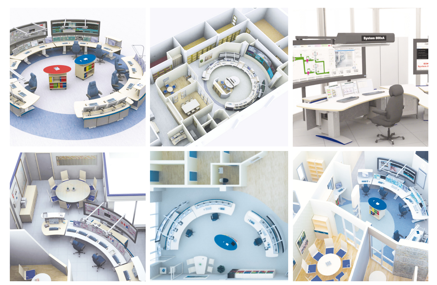
Figures 11-16 Examples of control room layouts with the operator in focus.

The ARC Advisory Group also emphasizes the importance of ergonomics in the control room. In a report written in July 2007, it recommends that "Design and implementation of control room and HMI, should include ergonomics and change management". It is further recommended that "Technology providers should ... propose solutions and implementation approaches that include ergonomics and change management skills".