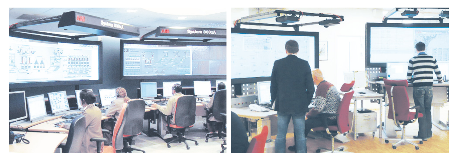
Figures 9-10 Extended Operator Workplaces from ABB with interactive personal large displays.

Live video is another good example of how this large EOW screen can be used. Instead of changing the focus to a separate console or separate CCTV monitor, the operator can instantly display the live video aspects of the actual process objects directly on the large screen. As this screen is integrated with the console, there is no wasted space on either side of it. Disturbing traffic is eliminated and the consoles can be moved around as conditions change. Furthermore, as the consoles are ergonomically designed they can be adjusted for individual operators. Adjustable arm-rests are integrated and there is plenty of legroom. All computers are normally removed from the control room and placed in a separate computer room with a controlled environment. In this way, the noise level can be kept to a minimum, and it is much easier to keep the control room floor clean. All of these factors work in favor of attracting new and hopefully younger operators into the control room.