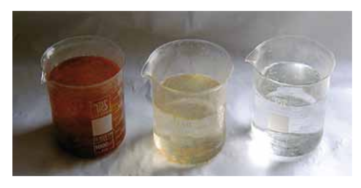
Water before, during and after treatment