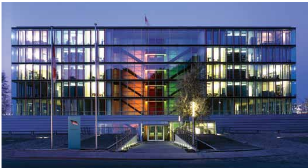
Rickmers Group headquarters in Hamburg