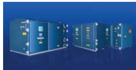
Figure 1. ABB's new explosion proof drive for underground coal mines.

Taking advantages of the heat transfer principle to cooling and selecting a low-power segment air-cooled inverter makes the ABB explosion-proof converter lighter and