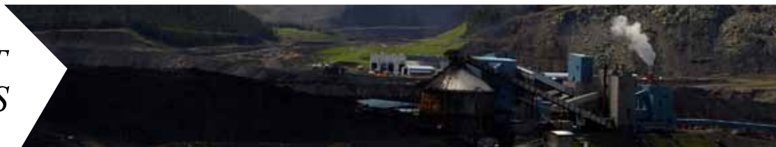
ABB New explosion-proof drive product for underground coal mine application

ABB, a leader in power and automation technologies, has launched a new explosion-proof drive product for underground coal mines (Figure 1). The drive covers the 660 – 3300 V levels, a power range of 200 kW – 2 MW and complies with (Exd[ib] I) explosion-proof and intrinsically safe standards. The product mainly applies to drive equipment requiring multipoint transmission, constant torque output and potential energy variation, such as ventilation fans, pumps, belt conveyors, armoured face conveyors, winches used in blind shafts and inclined shafts, and endless rope winches, etc.