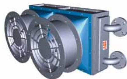
Figure 2. Air-water heat exchanging system.