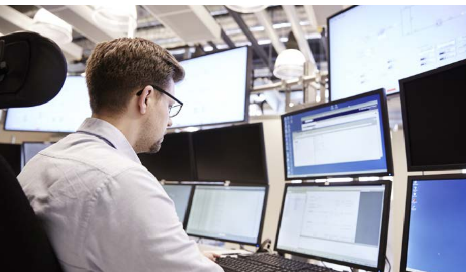
ABB Ability™ Performance Optimization for control systems – Harmony Service, identifies, classifies and helps prioritize opportunities to improve the performance of your control system. This service uses data collected during scheduled and ondemand analyses for comparison against best practices and standards to detect performance irregularities. This comparison quickly pinpoints issues, helping to improve system reliability, availability and performance.

Early detection of system performance irregularities