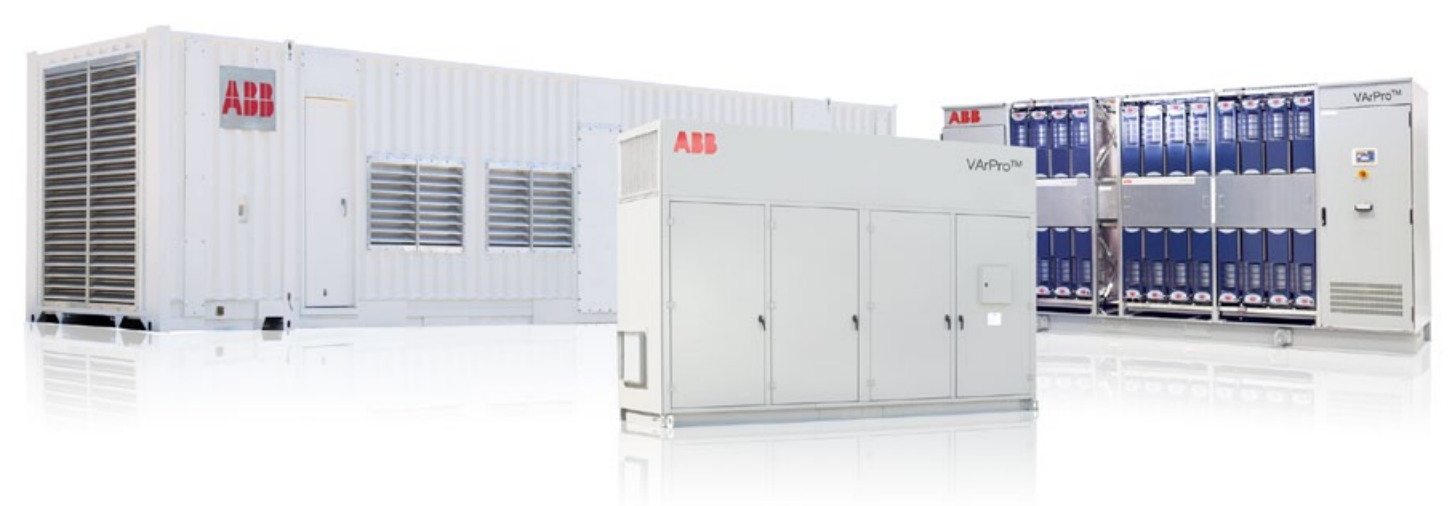
Containerized, or outdoor and indoor cabinet enclosure configurations