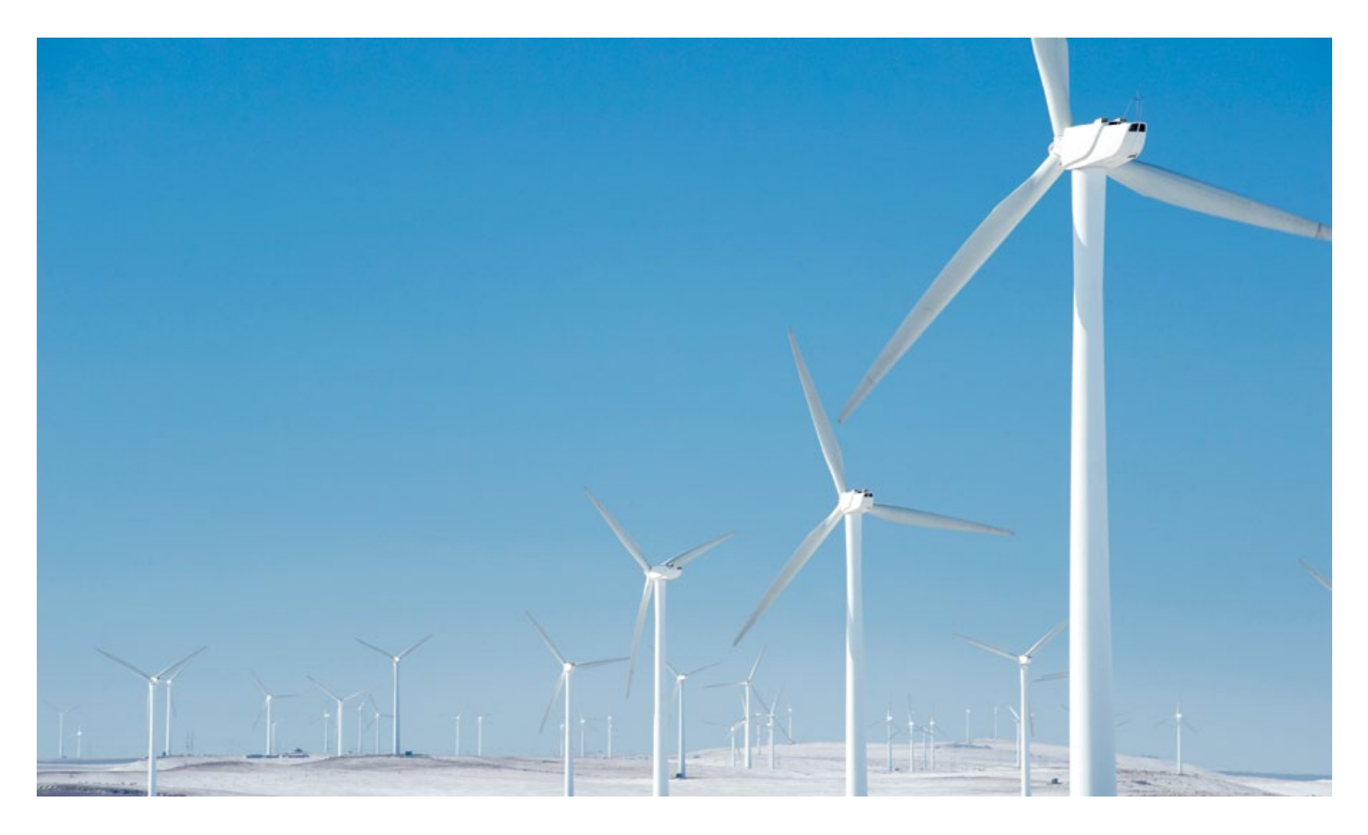
VArPro STATCOM gives you proactive solutions for reactive needs