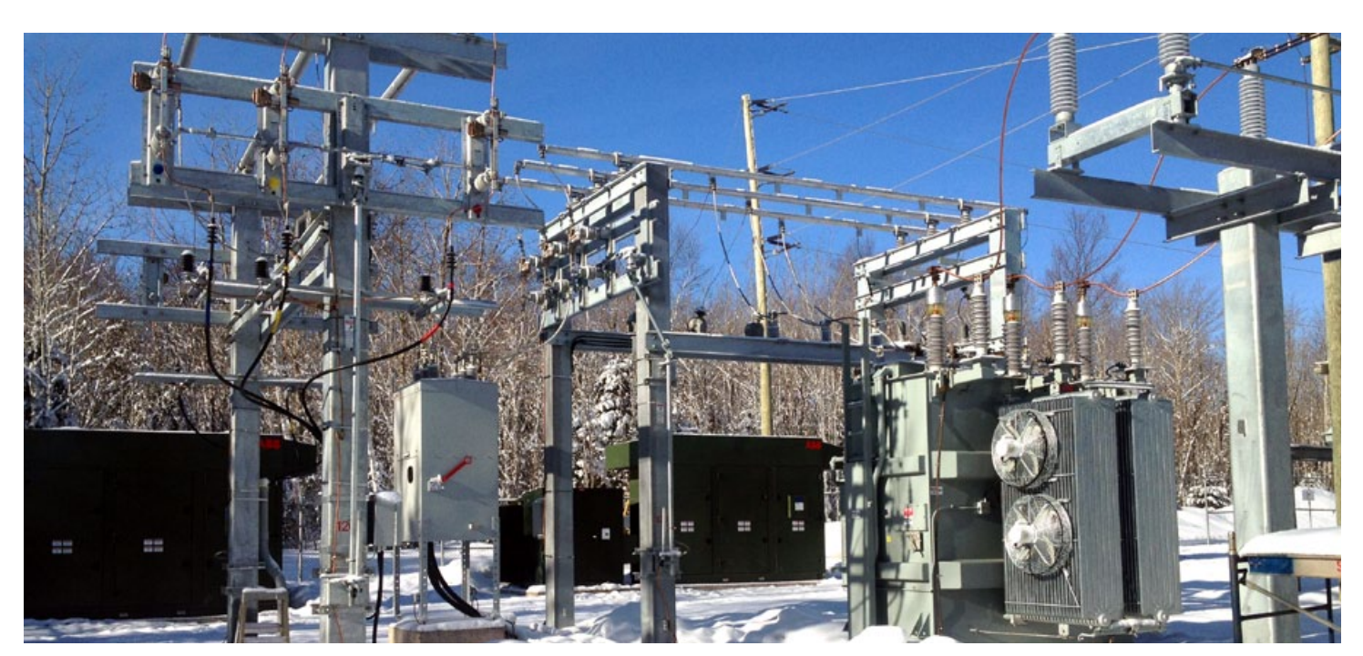
VArPro STATCOM installation at a substation in the Canadian Maritimes to support a growing wind farm installation