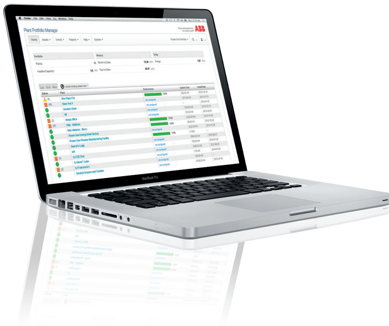
ABB monitoring and communications Aurora Vision® Plant Portfolio Manager

The Aurora Vision® Plant Portfolio Manager is a cloud based monitoring software. It enables customers to observe solar power plant production and rapidly identify unresolved site issues.