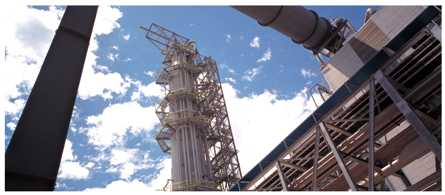
ABB used an effective strategy to expand its service business at an Indonesian pulp mill.

Using a strategy that capitalizes on the depth and value of ABB's offerings, ABB bundled services that will optimize a pulp mill's equipment and process performance