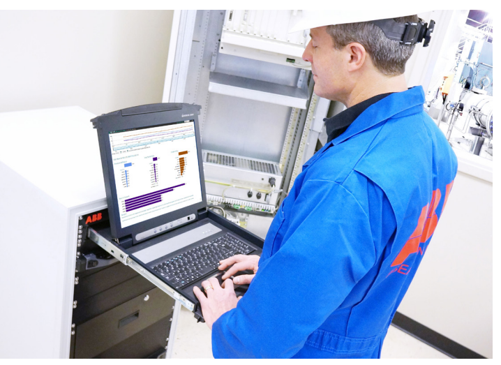
Customers and ABB engineers use ServicePort, a secure service delivery platform, to analyze Key Performance Indicators on equipment and processes. The pulp mill will have three ServicePorts to help mill personnel identify and correct potential problems.

The ABB team won this order with a sales strategy that capitalized on the customer's initial commitment to purchase APC. ABB was able to show the customer how APC delivery would be complemented with Loop Performance Service and three ServicePorts. With ServicePorts in place, ABB is positioned to deliver additional Advanced Services in the future.