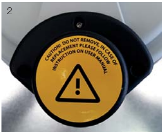
1 FPRC Foundry | 2 Slow retraction

Note We reserve the right to make technical changes or modify the contents of this document without prior notice. With regard to purchase orders, the agreed particulars shall prevail. ABB does not accept any responsibility whatsoever for potential errors or possible lack of information in this document.