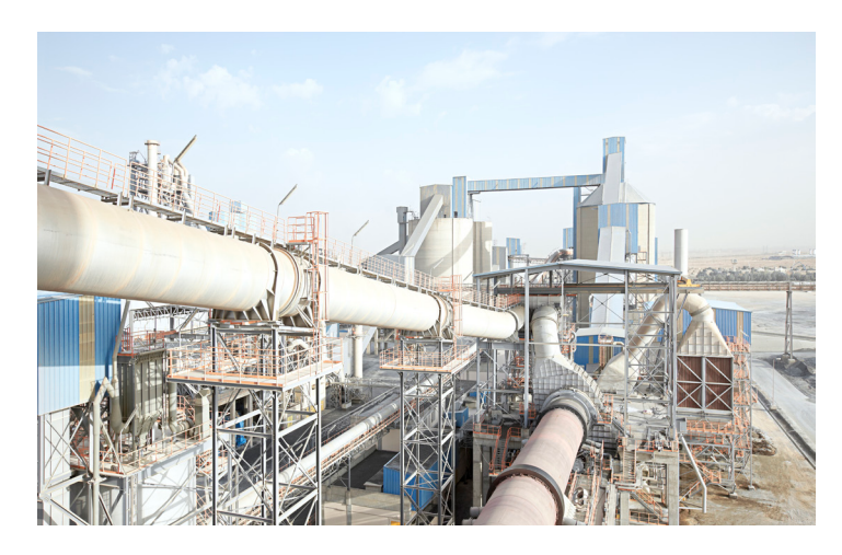
ABB provides integrated products, services and solutions to help customers in the cement industry optimize their power and productivity resulting in increased availability and lower investment costs

Since 2015, an Indonesian cement producer has worked with ABB automation specialists to engineer and commission their plant's automation system. With its local certified resources and process knowledge, ABB has been a key support for this customer in maintaining their production and expansion plans and growing successfully in a smooth manner.