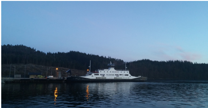
NORLED ferry, MS FOLGEFONN, operating in the southwest of Norway with UNITROL 1005

Its first installation was successfully commissioned by the company Westcon Power & Automation, Husøy Norway, on NORLED ferry, MS FOLGEFONN, operating in the southwest of Norway in April 2015. The ferry is powered by 4 diesel gensets and supported by a battery storage system to optimize continuous operation in terms of low emissions and low fuel consumption. The originally installed analog AVR's were replaced by 4 UNITROL 1005 AVR's. The newly installed digital AVR's showed excellent performance in reactive load sharing as well as stable regulation even with high harmonics caused by frequency converters on the AC bus. Westcon Power & Automation stated that the new UNITROL 1005 fulfill the high expectations regarding quality and user-friendliness as it is known from the UNITROL 1000 family.