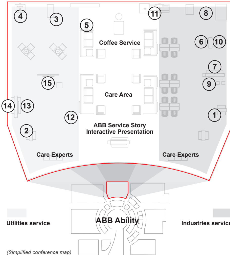
ABB Service Booth

Come together for an event created to provide an innovative look at new ideas, trends and technologies. Choose from hundreds of networking and learning opportunities that showcase new ways to navigate our increasingly interconnected world, and learn how industrial digital technology can help you do better, do more and know more. Bolster your experience at the show by visiting the service booth and leveraging the expertise and resources to enhance the efficiency of your processes and maintain the longevity of your equipment.