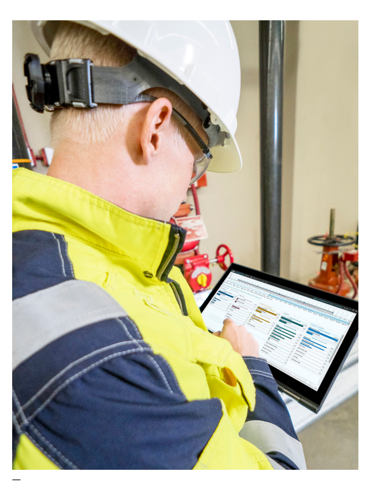
02 The ABB ServicePort Service Delivery Platform runs on a server and provides data analytics to users through multiple interface options, from environmentally hardened workstations through hand-held tablets as pictured here.

Using the System 800xA Performance Service, Celulosa Arauco obtained an automated control system checkup that provided a benchmark for system performance and configuration. The plant managers use the comprehensive diagnostic analysis tools to assess their control system's operation, implement improvements, identify, classify, and help prioritize opportunities for improved performance.