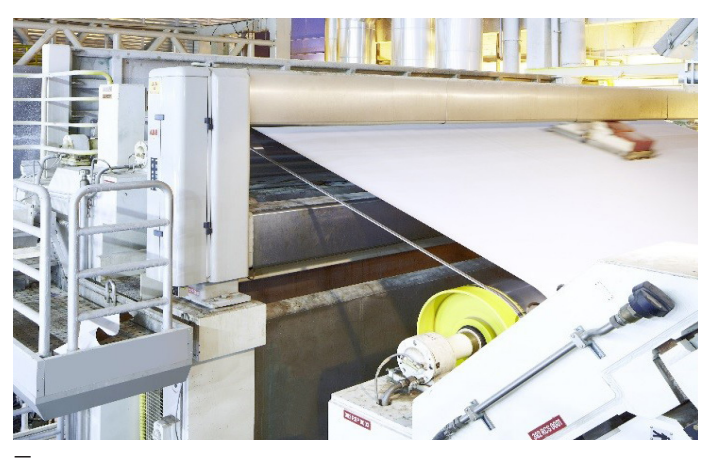
04 Celulosa Arauco uses ABB Quality Control Systems. Pictured here is an ABB Network Platform that is scanning the paper web to ensure that all quality parameters are met.

The performance of each control loop is evaluated based on responses related to: control, process, and signal conditioning. Each loop that gets a lower rating is counted as having an issue that needs investigation. This does not always mean there is a problem. However, a large number of issues indicate that there is room for improvement. The following figure shows the number of issues by each category.