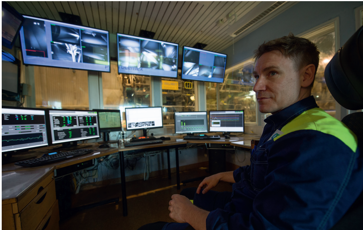
The working environment at the screens has been significantly simplified and pedagogically designed.