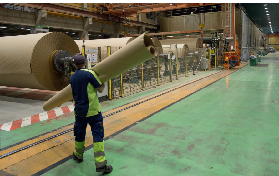
ABB ensuring availability and safety at SCA Obbola Drive systems upgrade

SCA Obbola has the largest paper machine in Europe for manufacturing packaging paper. For the ongoing process upgrade, SCA Obbola selected ABB as the supplier for both its drive and control systems. At the same time, the entire mill will achieve world-class machine safety.