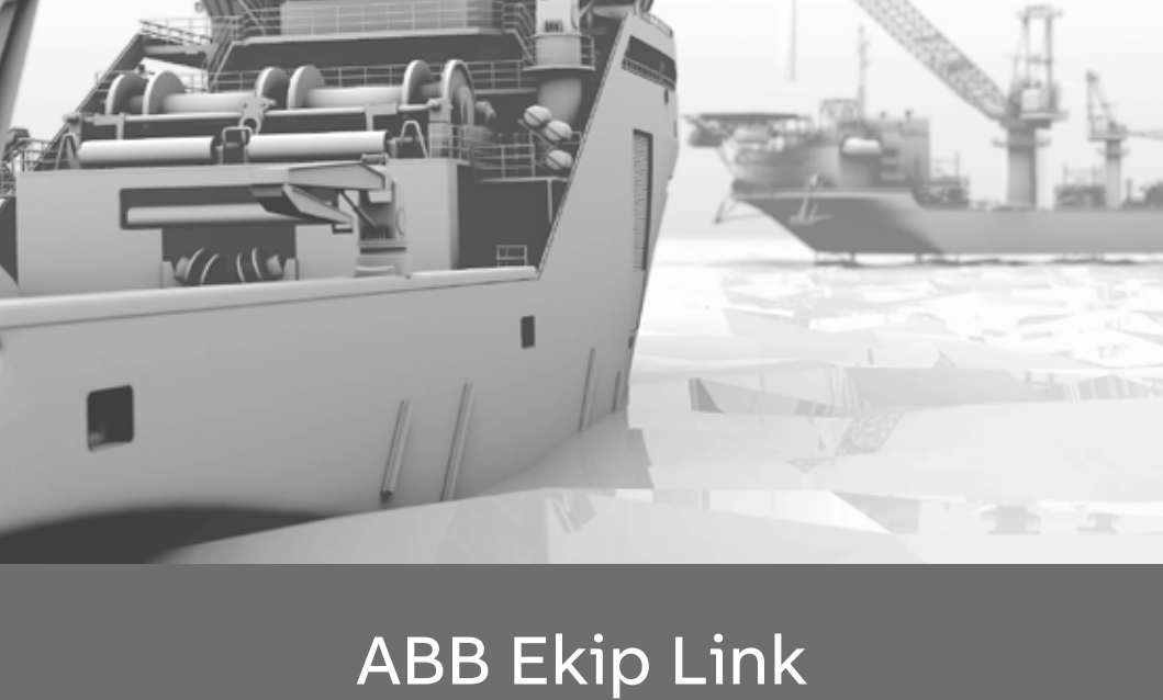
ABB Ekip link system with Emax 2 bring service continuity to a new level for the ships of the future.