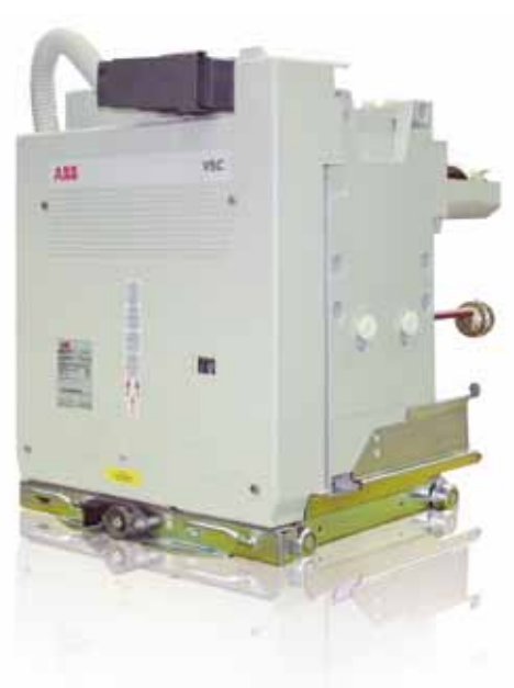
VSC-SRC version for marine plants