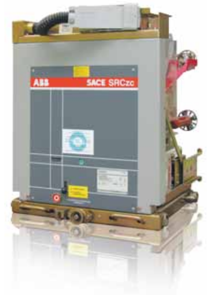
SRC - SF<sub>6</sub> gas contactor