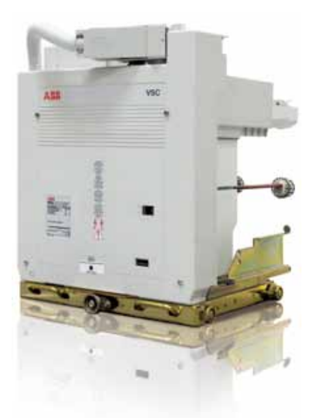
Retrofitting solution with VSC-SRC vacuum contactors

Specific operating procedures have to be applied during maintenance activities and these must be performed by qualified personnel according to EC Regulation 305/2008 and the SF_6 gas must be treated as laid down in EC Regulation 842/2008.