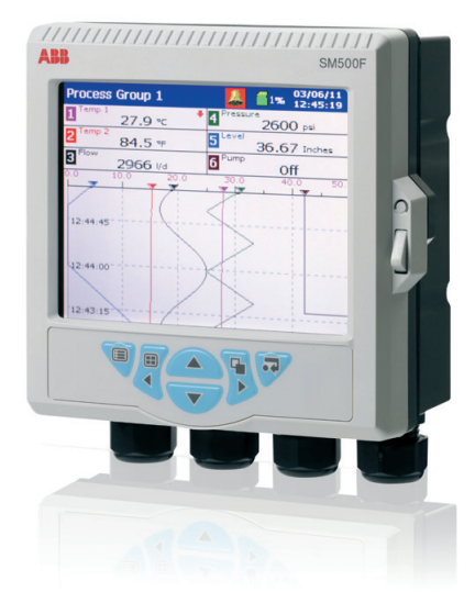
SM500F Videographic recorder

The SM500F is the world's first field mountable paperless data recorder. Featuring seven channels and available with wall, panel and pipe mounting options, it provides a truly simple recording solution that can be used anywhere, anyhow and by anyone. Its fully sealed IP66 and NEMA 4X enclosure means it is ideal for use in even the most hostile environments, including hosedown and dusty applications.