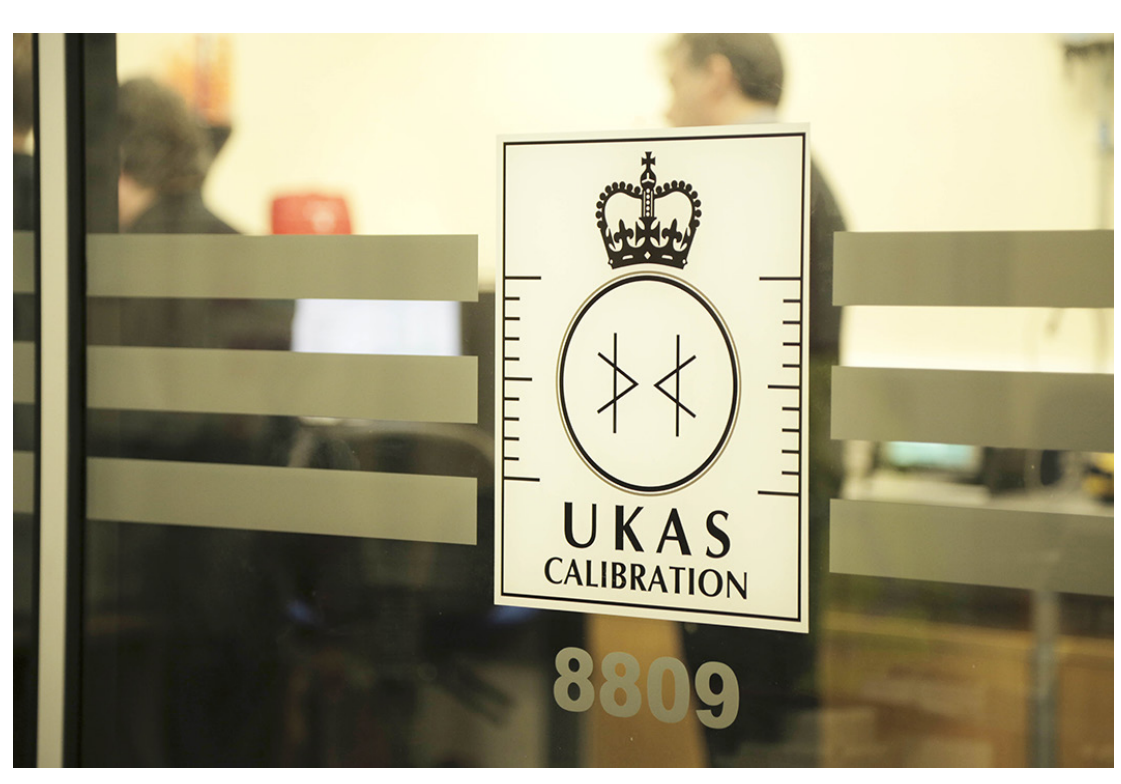
Figure 3 In the UK, all accreditations for testing and calibration are managed by the United Kingdom Accreditation Service (UKAS)

This last requirement, regarding accreditation to international standards, helps to ensure that an accreditation awarded in any particular country is recognized globally as long as the organization that awarded it was itself an accredited body. In the UK, all accreditations for testing and calibration are managed by the United Kingdom Accreditation Service (UKAS), that operates in accordance with ISO17011:2004, a global standard governing the general requirements for accreditation bodies.