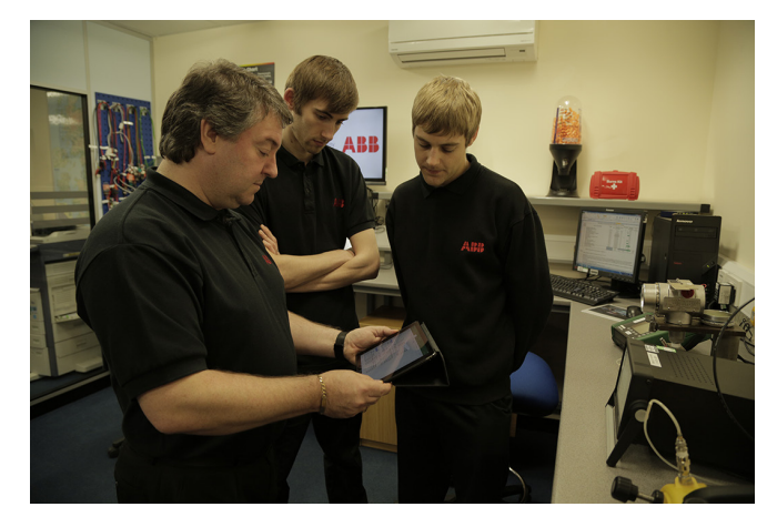
Figure 1 One of our two accredited calibration laboratories at Stonehouse, UK

The main aim of calibration is to introduce a known standard 1 That they operate and adhere to a clear set of against which the accuracy of a measurement can be compared. For providers of calibration and testing services, it is necessary to show how that known standard was itself arrived at, in order to provide the traceability needed between the end measurement and how it was arrived at.