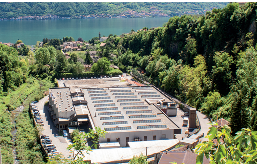
ABB factory | Ossuccio (CO) | Lake Como | Italy

The shore of Lake Como where ABB instruments are born