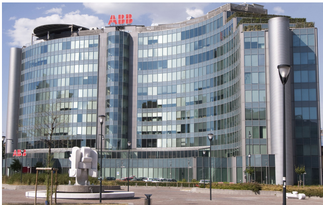
The Blue Building, Headquarters of ABB in Italy, based in Sesto San Giovanni (Milan)

“Our leading position stems from the fact that we submit proposals as consultants and not as product vendors. Our technicians are experts on technical as well as regulatory matters. This is how, faced with customers who experience the IPCC (Integrated Pollution Prevention and Control) regulations as a burden, we are able to help them understand what the real need for intervention is, how to improve their investment, how to find the solution that best solves their problem from a regulatory, technical and economic point of view.”