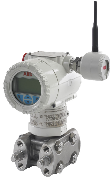
ABB 266 series pressure transmitter with wireless FIELDKEY (manufactured in Ossuccio)

Over the decades, the factory has continued to flourish due to the policy of integration and expansion in the various markets that the ABB Group has pursued over the years. This is mainly thanks to the contribution of skills from Kent and Taylor, so much so that at the height of its expansion its staff numbered no fewer than 600 people.