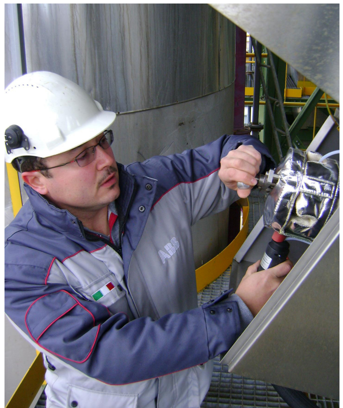
ABB engineer undertaking commissioning and startup activities at customer's site

It is partly this complexity and partly in thinking about the market approach philosophy (“listen to the customer and resolve his problem in the simplest possible way”), which recently led the BU to launch the Measurement made easy campaign.