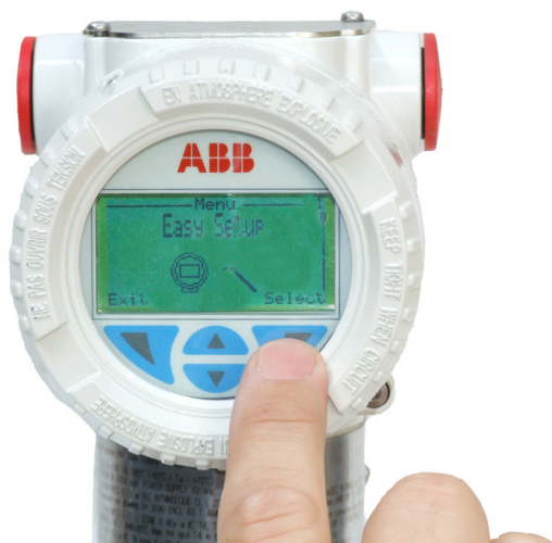
Quick configuration of 266 series multivariable transmitter using the 'Easy Setup' function at the instrument

DHH805 was born by listening to customer requests to simplify operations in plants and to make them more efficient in accordance with the Measurement made easy philosophy.