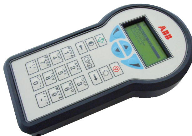
ABB's new DHH805 HART handheld terminal