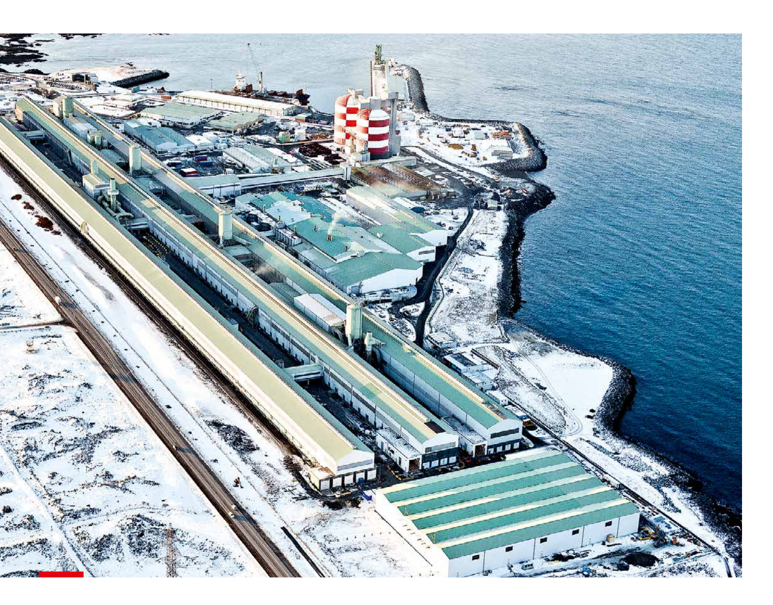
ABB in primary aluminium From mine to market