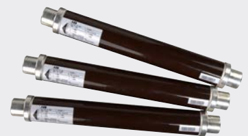
HV HRC fuses