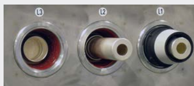
Plug-in busbar connection