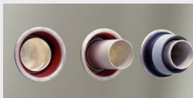
Plug-in busbar connection