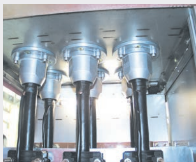
Cable termination compartment with inner cone connectors

Shockproof voltage transformers are plugged into inner cone sockets. These are removable or isolatable for test purposes, especially for cable testing.