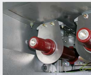
Cable termination compartment with outer cone bushings