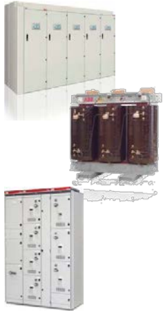
ABB MV Switchgear (ZX, UniGear, ZS8.4, SafePlus)