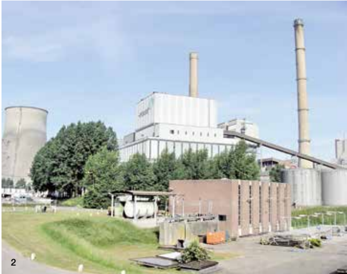
1 Rostock Hardcole Power Plant, Germany | 2 Amer 8 STPP, Netherlands