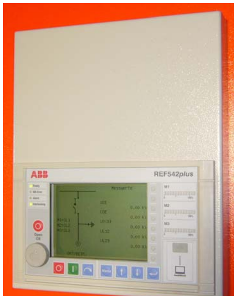
REF542plus with adaption kit