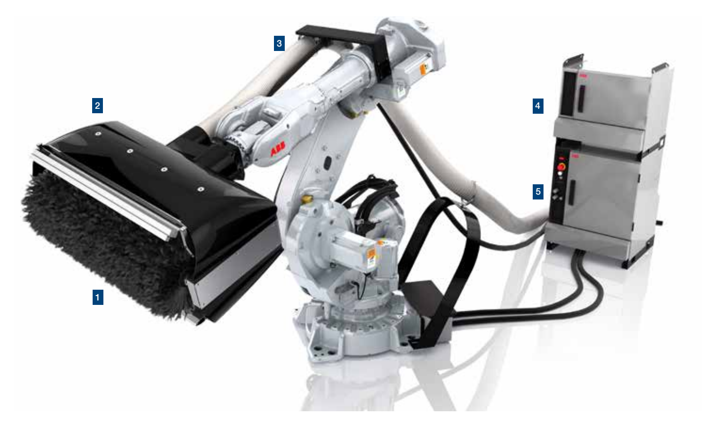
IRB 6700 Robot | 1 Ostrich Roller | 2 Ionization Unit | 3 Exhaust System | 4 Process cabinet | 5 Robot cabinet