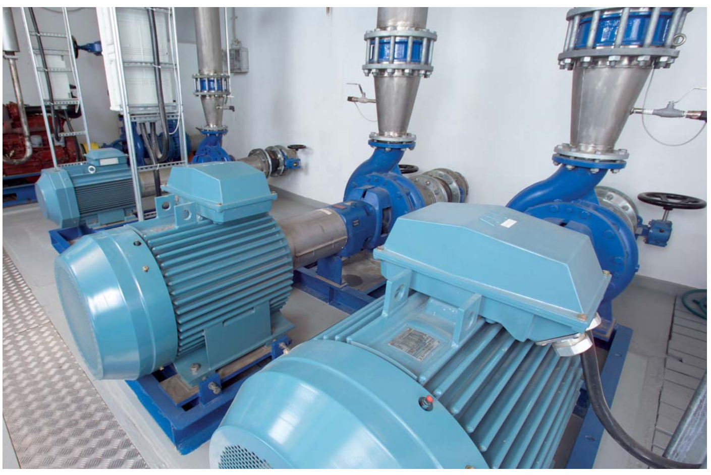
Parallel AC drives and pumps provide system redundancy at pressure boosting station.