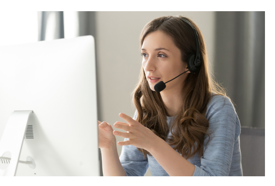
ABB Technical Support helps you to maximize your asset uptime with access to ABB technical experts in motors and drives. Our experts ensure a rapid resolution time with assisting you to maintain your critical operations.

Fast asset recovery with direct access to ABB's expertise