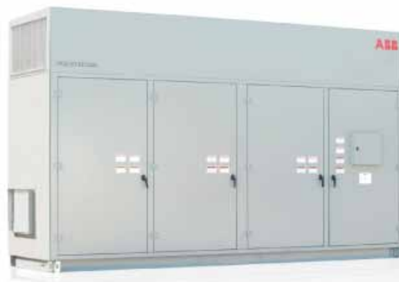
PCS100 STATCOM that is providing voltage regulation to the steel industry

ABB's technology provided a range of benefits, including the modular construction of the PCS100 STATCOM, which makes the platform very reliable. If one of the power modules fails, the system will not trip, but will continue to operate at reduced capacity. This level of reliability is unique in the industry. Also the PCS100 STATCOM has a smaller footprint, a smaller parallel capacitor bank, faster dynamic performance and active filtering