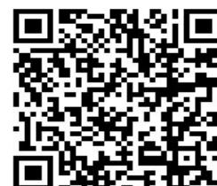
ABB Review featuring power protection technology

www.abb.com/energystorageandgrid-stabilization