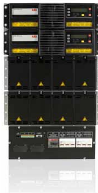
ABB's DPA UPScale RI 22, which has been used to provide SES with a uninterrupted power supply.

ABB UPS units achieve efficiency of 96 percent, an industry best. In times of rising energy prices, high efficiency has a high value – not to mention the benefit to the environment of reduced CO 2 emissions.