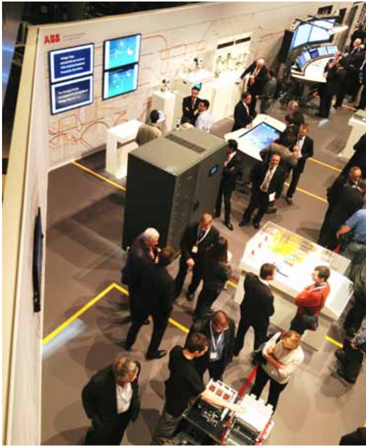
ABB Automation and Power World Switzerland 2013: PCS100 makes a stand