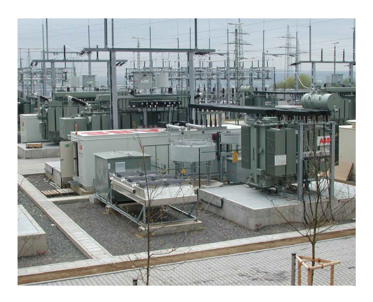
ABB 15-MW - Standard Converter - 8 Units 3AC 20 kV 50 Hz - 2AC 110 kV 16.7 Hz 151.2 MVA / 120 MW